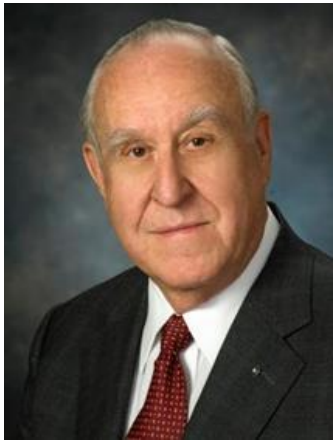
John F. Germ President 2016-17

Rotary Club of Chattanooga Tennessee, USA