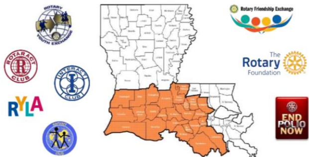
Rotary International District 6200

You have two hands. One to help yourself, the second to help others.